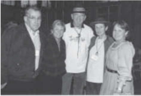
Photo Highlights of the 2022 Annual Meeting