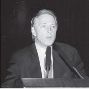
Photo Highlights of the 2003 Annual Meeting